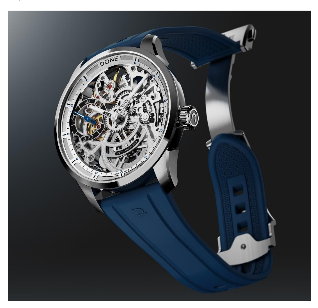
"A fusion of strength and simplicity for unmatched intensity" — This is how we define our latest MECHANICA B03 Titanium.

A collective endeavor that has brought to light the exceptional craftsmanship of our partners and swiss suppliers. Every detail of this exclusive edition, limited to just 50 pieces, has been meticulously refined: an ETA 6497-1 movement, expertly reworked into a striking silver skeletonized version, a Grade 5 titanium case enhanced by a subtle interplay of polished and satin finishes, and a blue FKM rubber strap featuring a new titanium deployant clasp.